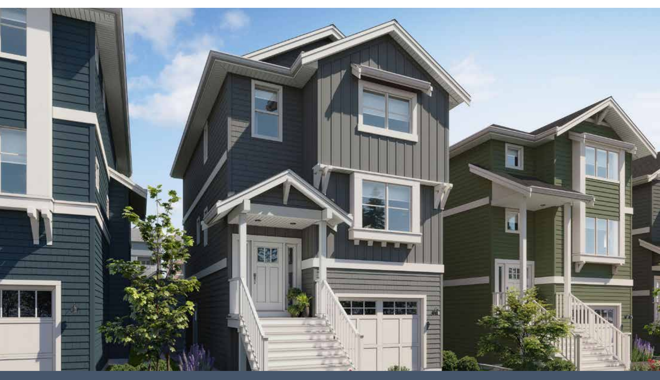
These plans and renderings are not intended to fully or completely represent the final product. Plans and renderings provided are preliminary layouts only for general review of type and size by client group. All sizes are approximate and subject to revision as design development proceeds. Details including but not limited to colours, interior and exterior details, landscaping, existence and location of retaining walls, views, and type and location of development on surrounding properties are all subject to change. Renderings are an artistic representation of the proposed home.